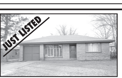
Opportunity!!! Priced Right 2BR, 1 Bath 1410 W. 5th $59,500