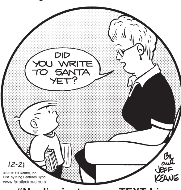
"No, I'm just gonna TEXT him in a couple days."