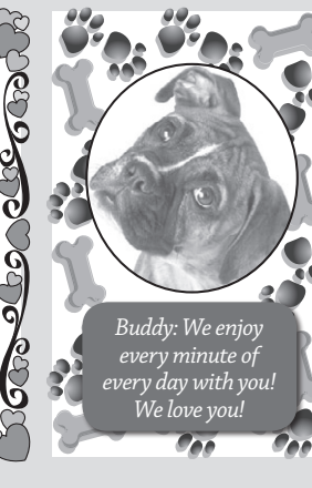
Ad #1: Retro Heart Ad #2: Simple Heart Ad #3: Heart Cluster