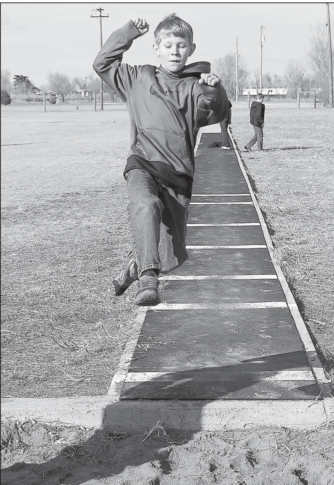
GOLDEN PLAINS MIDDLE SCHOOL

The next game for the Lady Trojans was Friday against Northeastern Junior College. Game time is 2 p.m. at the Carl Adams Softball Field located on the southeast corner of campus.