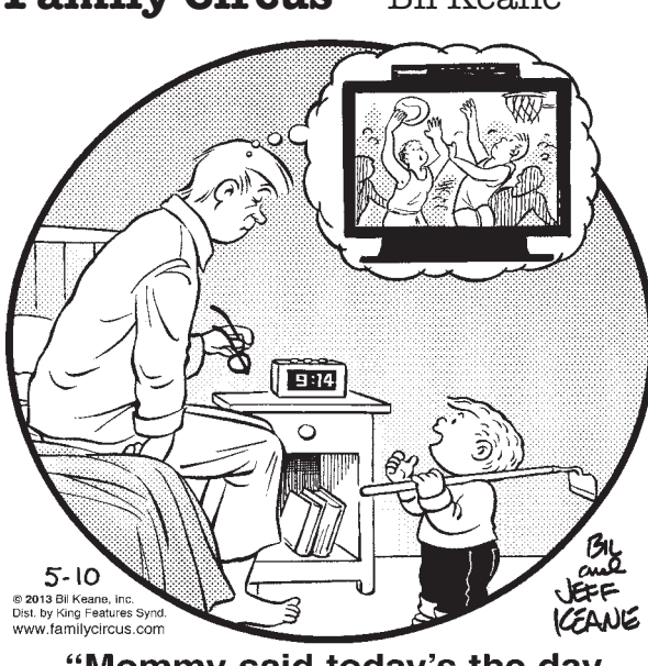
"Mommy said today's the day you promised to help make my garden."