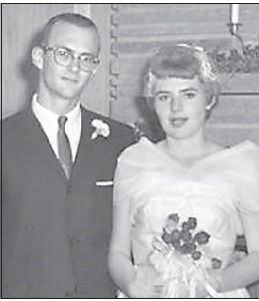
The Barretts in 1963