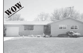
Lovely Brick 4-5 BR, 2 1/2 Baths, Beautiful Yard 535 Walker $159,000

Stock Realty & Auction Co. www.stockra.com 390 N. Franklin Ste. 100 Colby, KS 67701 (785) 460-7653