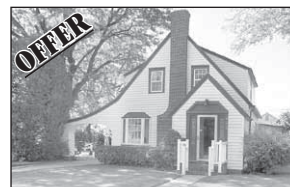
Traditional 5 BR Home, Bsmt, 2 Garages, Corner Lot 480 W. 5th $141,000