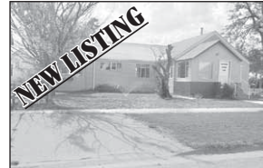
Winona...Home, Has a New Look, 4 BRs 305 Wilson $46,900