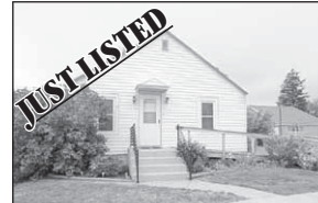
Brewster...Home, 3-4 BR, 2 Bath, Bsmt 414 Nebraska $49,500