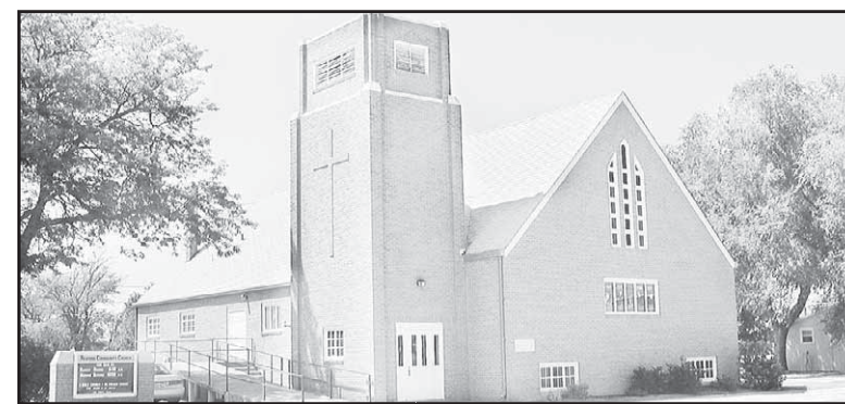
Rexford Community Church

Worship in the church of your choice this weekend.