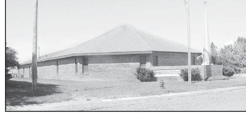
Brewster Community Church