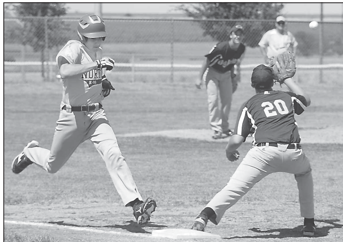
A Norton batter hustles for an infield hit, but his team fell short in Saturday's closest K-18 West Regional game against Oakley. Goodland was the only lower seed to win this weekend.

More details will appear in the Free Press later this week.