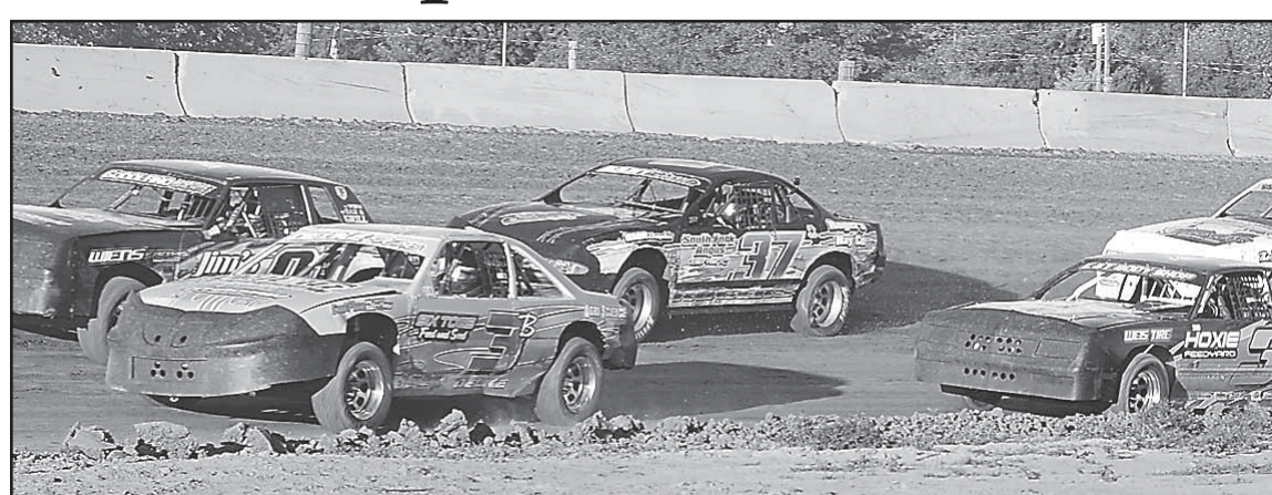
Championship races on Sunday evening at Thomas County Speedway will be close just as they were during this showdown on July 21.