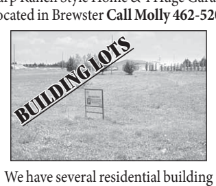
lots available Call Molly 462-5203