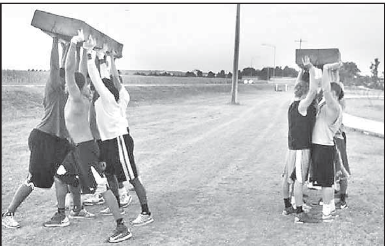
Colby Community College