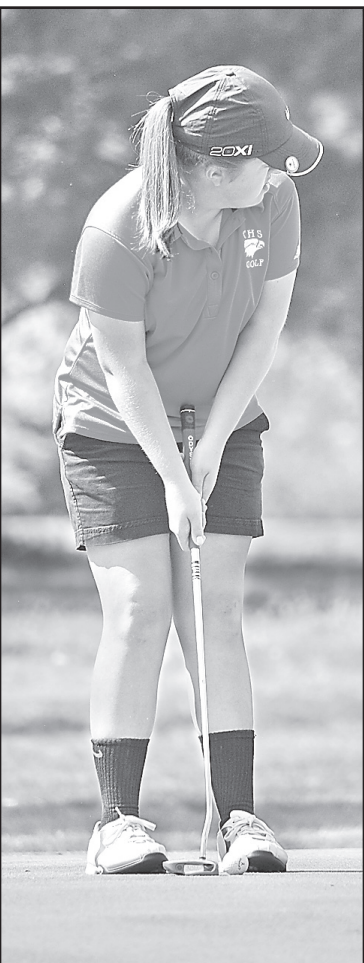
KEVIN BOTTRELL Goodland Star-News

The state tourney tee times are already set. Colby's schedule: Mengel (9 a.m. on tee 10), Zerr (9:30 on 10), Barton (9:40 on 1), Sloan (9:40 on 10), Crampton (10:10 on 10) and Kern (10:20 on 1).