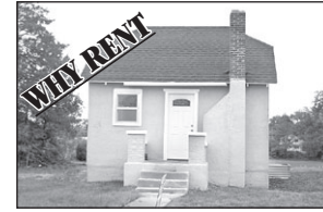
An Adorable, Affordable Home with lots of New 555 Martin $39,900