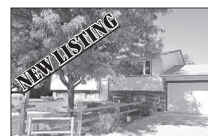
Wonderful 5BR Home. Open Floor Plan & Lots of Extras 1835 W. 5th $156,900