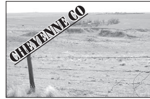
470 +/- Acres of Grassland & Cropland Cheyenne County, KS