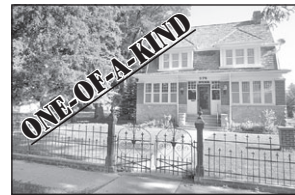
A Perfect Family Home "A Must See" 375 W. 5th $239,000