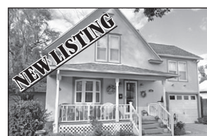
A Great Home with a "New Look" 4BR, 2 Bath 375 W. 7th $142,500