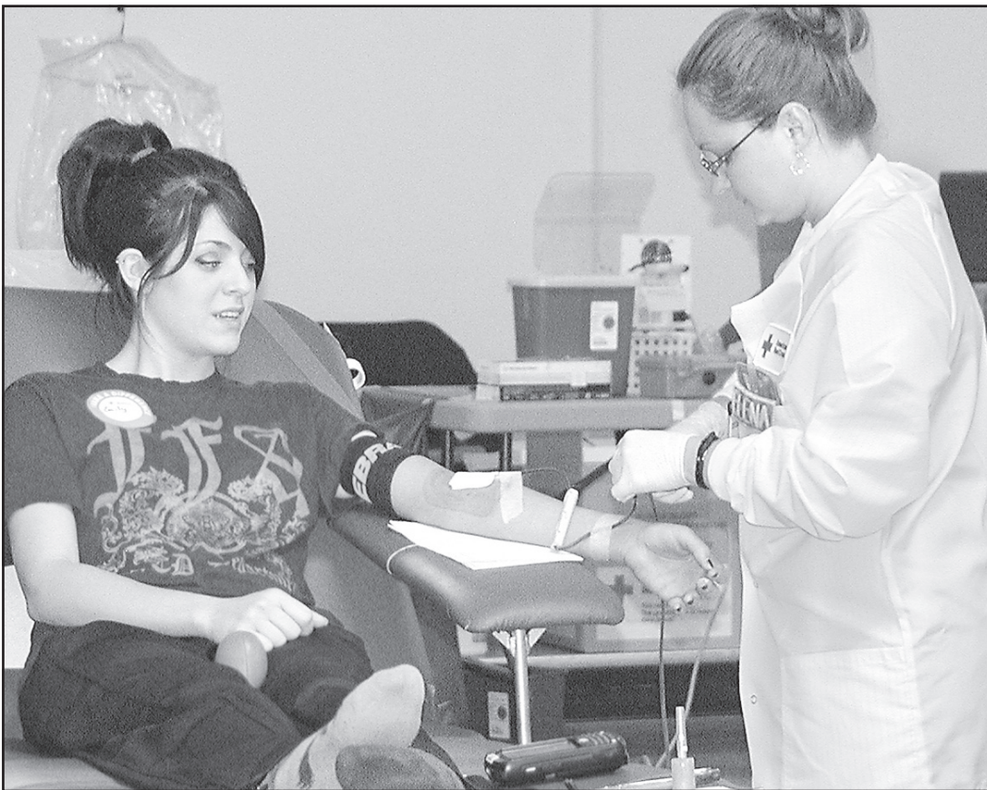
A donor gave blood on Oct. 29 in the basement of the Community Building. The Red Cross fall blood drive saw a good turnout this year, with 71 people donating blood that day and 58 on Oct. 30. The organization had hoped for 82 on Tuesday and 55 on Wednesday. The Red Cross had an "Alyx Machine" at the blood drive, which separates the components of blood, collecting more red blood cells with each donation.