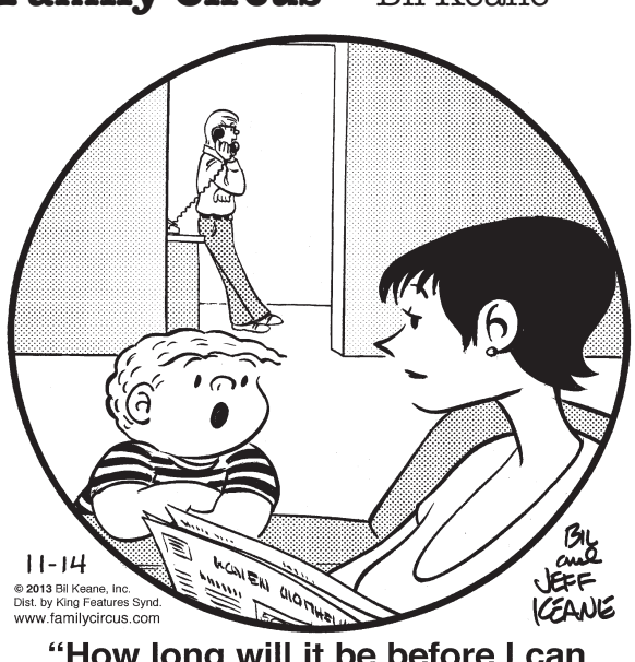
"How long will it be before I can make my voice sound as IMPORTÁNT as Daddy's?"