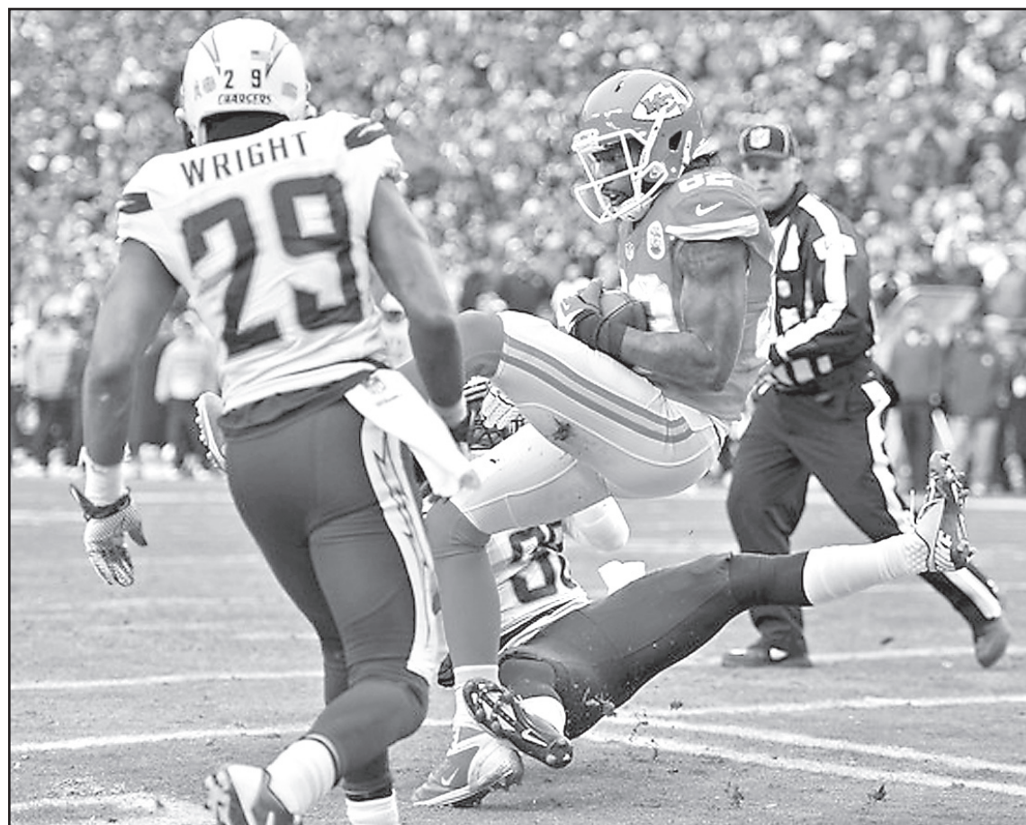
Kansas City wide receiver Dwayne Bowe tumbled into the end zone against San Diego last month. Due to a concussion, Bowe will likely not play in the Chiefs' rematch at San Diego on Sunday.

Ravens at Bengals Ditka: Bengals. Jackson: Bengals. Johnson: Bengals. Golic: