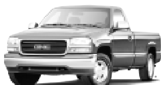
2000 Regular Cab Pickups