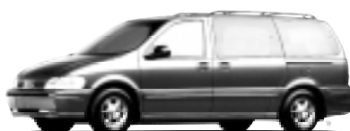
2000 Oldsmobile Silhouette

Over $3,000 off on select models 3.9% Financing on all New 2000 Model GMC & Chevy 1/2 & 3/4 Ton Trucks.