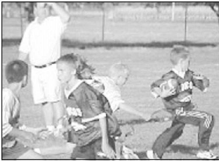
A player gets his flag pulled as he runs down the field at North Elementary. Games started on Aug. 28 and will continue every Monday and Tuesday night through Oct. 10 at 5 p.m.