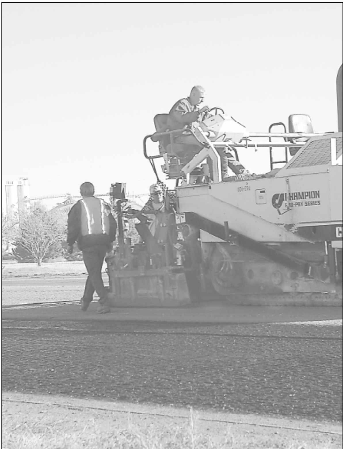
Workers from Hi-Plains Sand out of Kanopolis worked on repairing their equipment this morning. The crew started laying asphalt on K-27 today. The work will continue until at least next Friday.