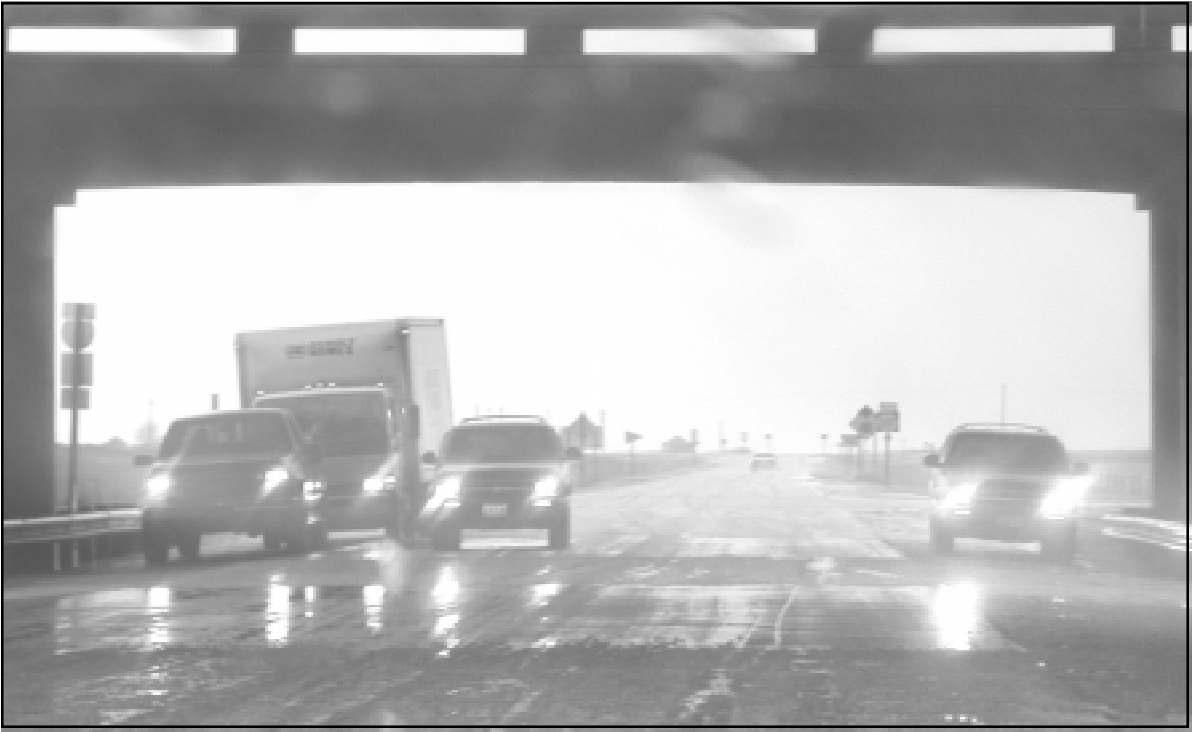
Hail from a series of storms Tuesday afternoon had motorists on I-70 parking under the overpass at the Kanorado exit. Golf-ball sized hail covered the highway for several miles east of Kanorado.