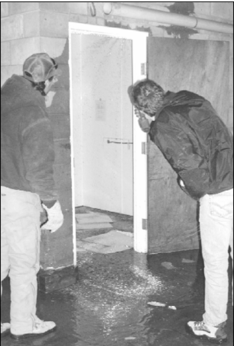
City workers and firemen surveyed the damage today at the old Jubilee Food's building on 12th Street after the fire system broke, forming a small river of water.