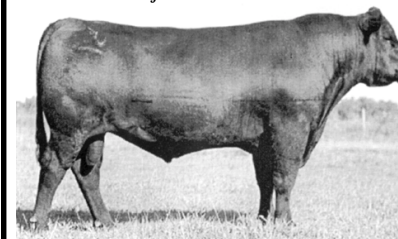
The calving ease specialist, high maternal, one of the highest marbling sires based on ultrasound data

GDAR TRAVELER 71 Sire of RCC Traveler 71 4216