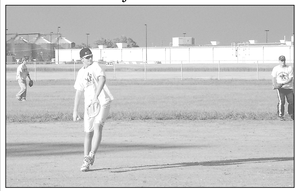
Goodland's American Legion team practiced yesterday in preparation for their first game. The team plays a double-header against Grainfield on Sunday.