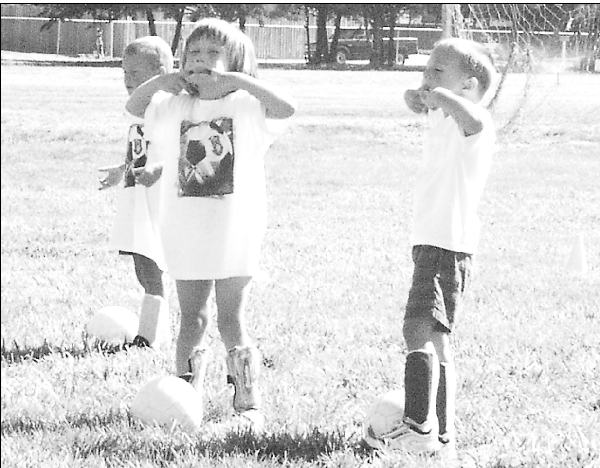
Kids participating in the Challenge Sports soccer camp held at North Elementary School made sure they stretched properly before playing soccer Friday. Four European professional soccer players were the camp's instructors.