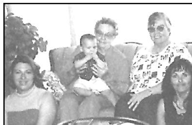
Five generations now.