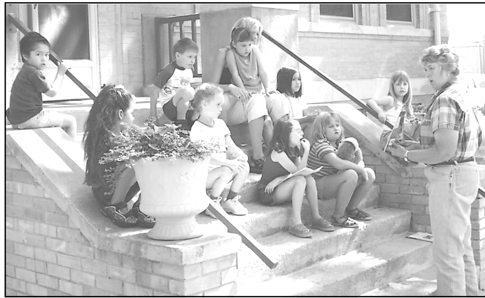
Students in the summer art program at Carnegie Arts Center sat on the front steps of the center for one of their classes held last month.

A scrapbook of all the children's photos is available at the Carnegie Arts Center, Downs