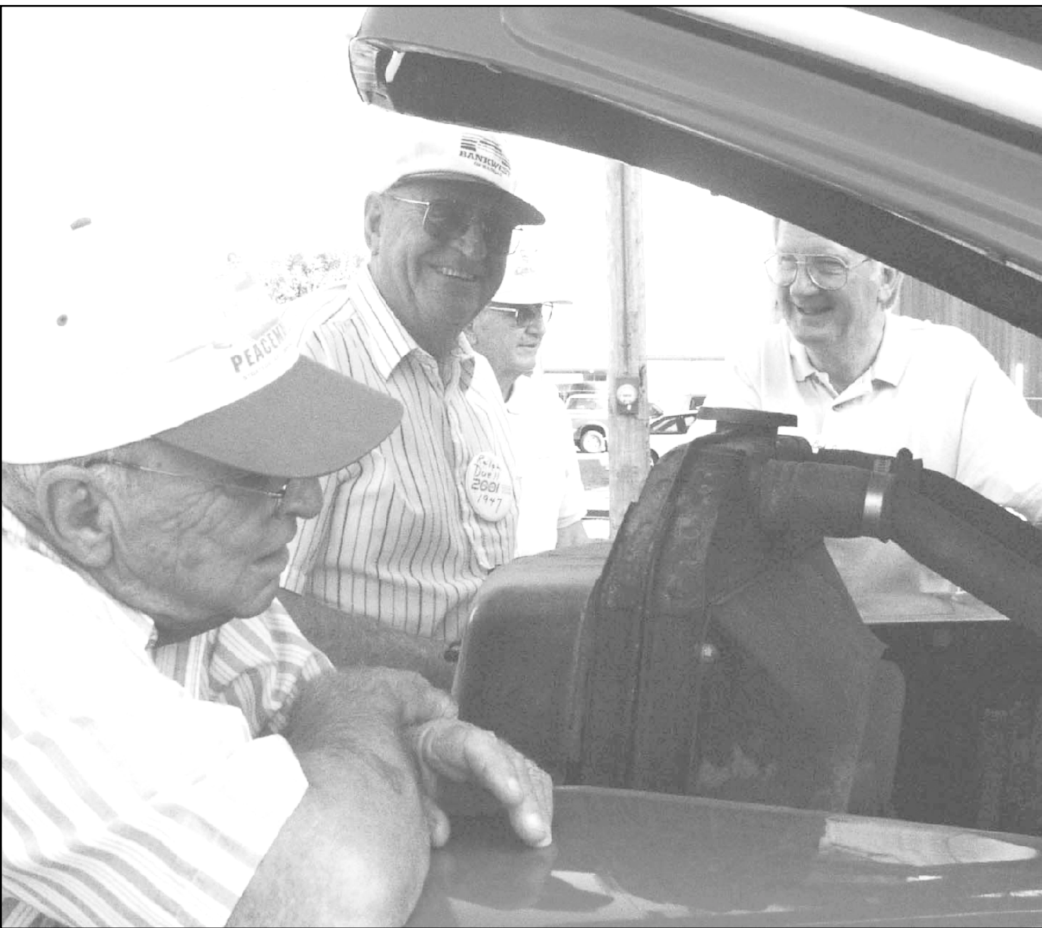
Members of the Class of '47 checked out the engine of the antique truck they used for the fair parade Saturday.