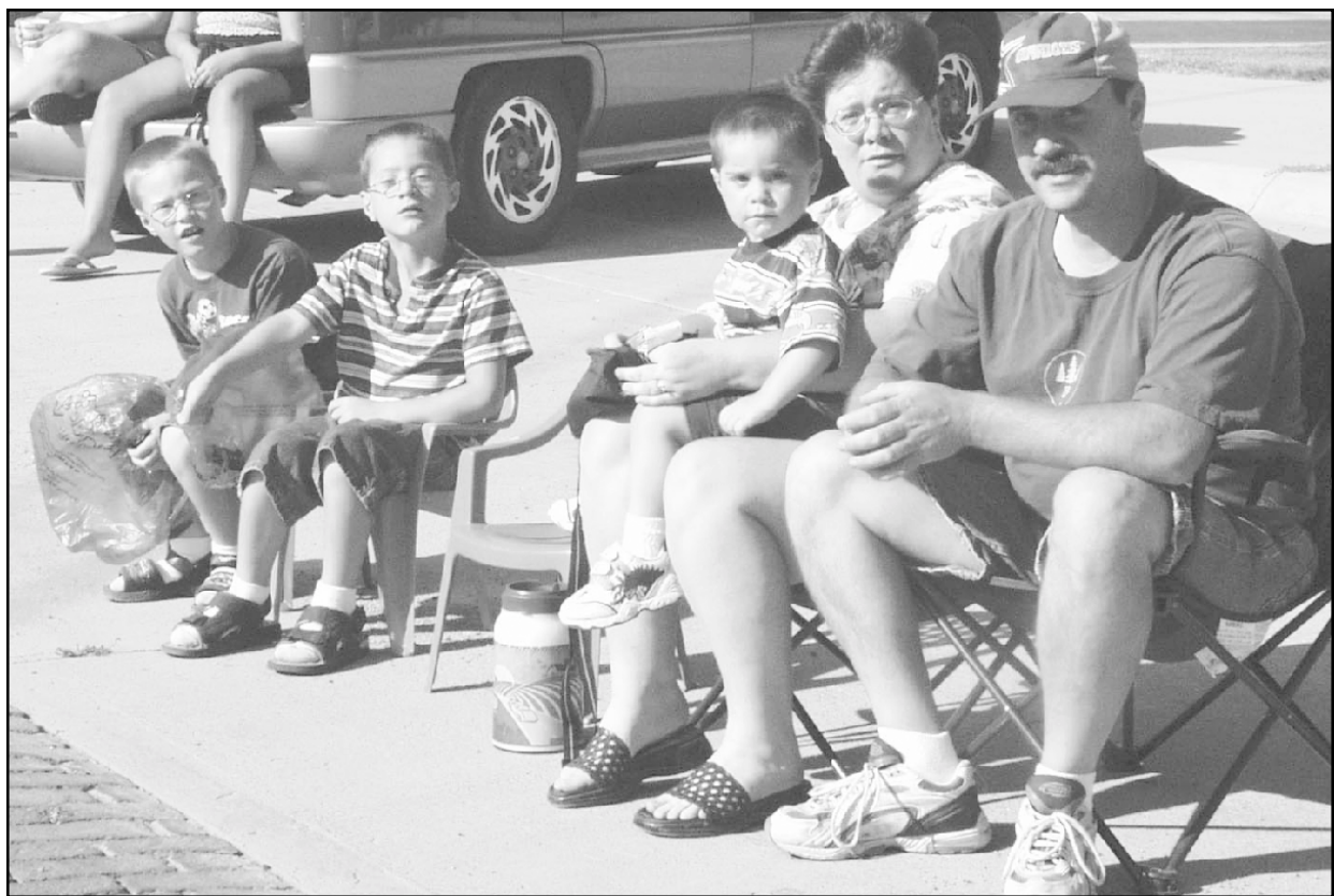
This family was prepared for the Northwest Kansas District Free Fair parade Saturday, including the bags to collect the candy thrown from many floats, cars and horses.