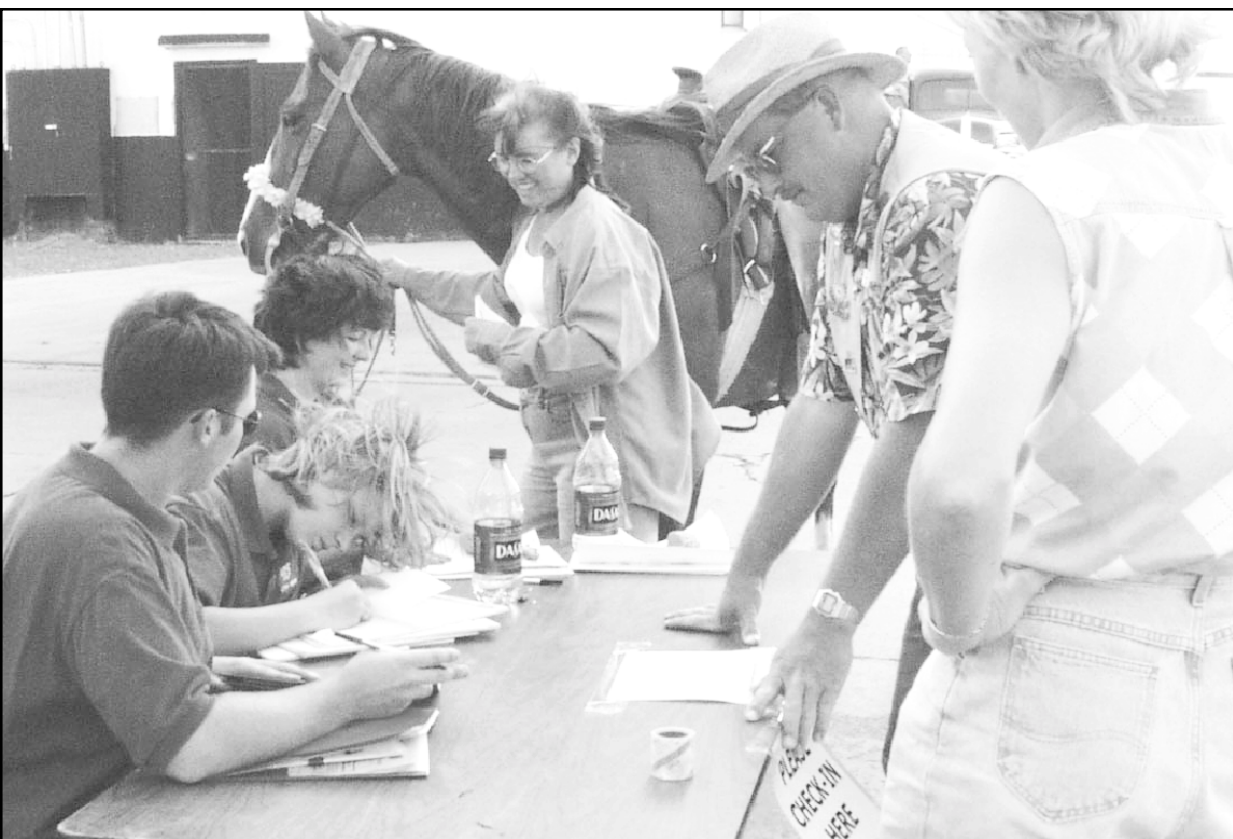
4-H ambassadors handled sign-in for the parade, and used the information to give to the announcers so the audience and judges knew who was in the parade. The ambassadors handled all the parade organization.