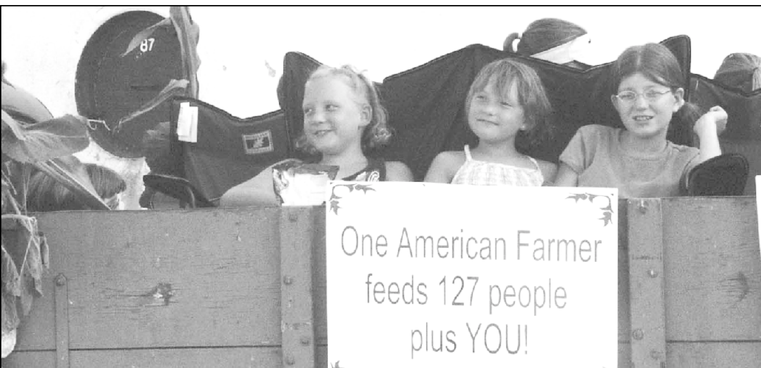
Relaxed in the shade, these three young girls awaited the start of the fair parade, and were ready to throw candy to the audience.