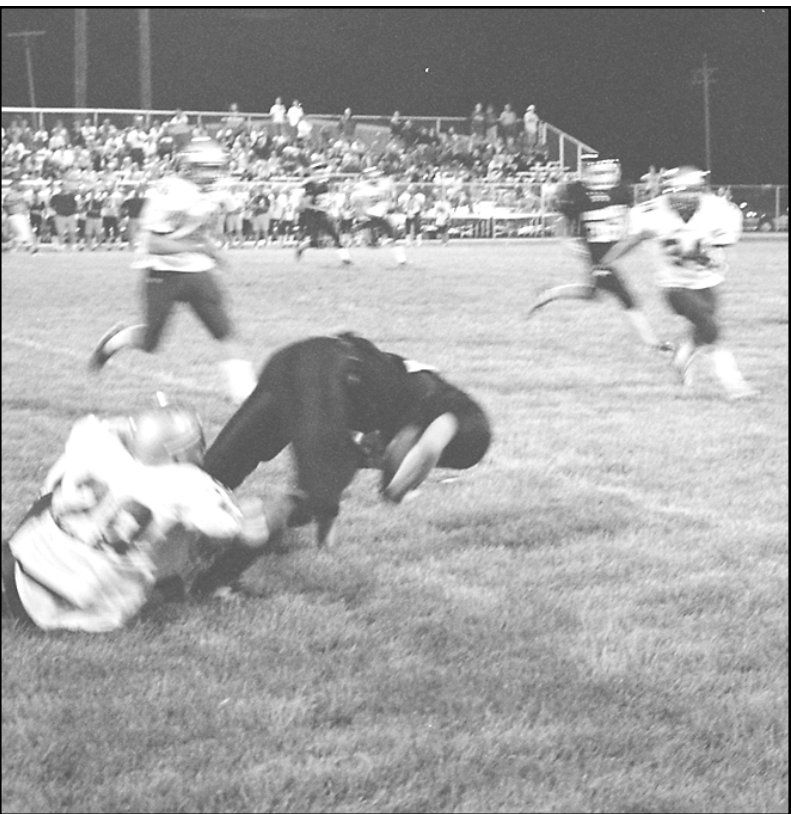
A Goodland player tried to break free from a Hays tackler to get more yardage on Friday. The Cowboys put forth a good effort but were defeated by the Hays Indians 51-14 in their first game of the season.