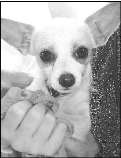
"Tad," a Chihuahua and terrier mix, participated in the scruffy dog contest on Saturday.