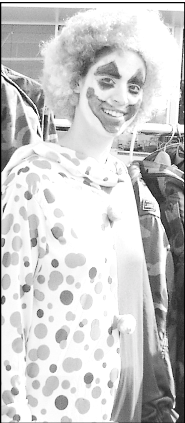
A clown dressed in bright clothes and rainbow-colored hair sold balloons for a quarter each.