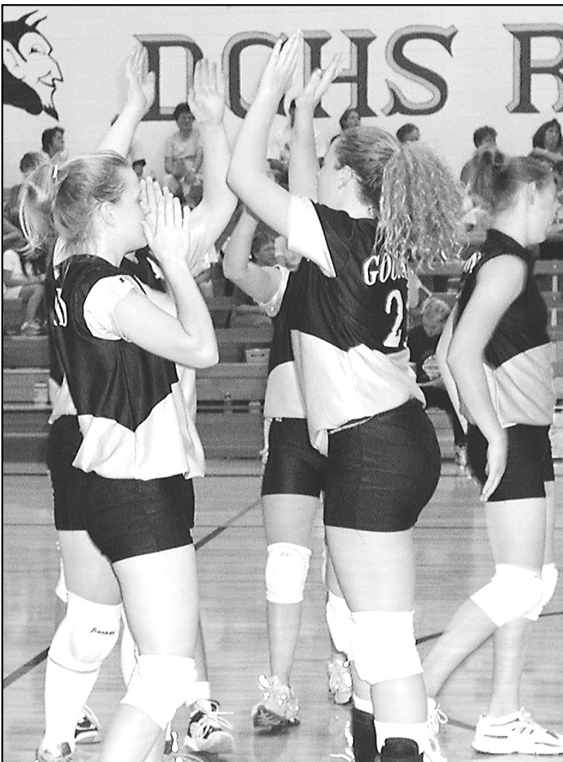
The junior varsity Cowgirls celebrated after scoring a point against the Oberlin Red Devils on Tuesday at a tri match in Oberlin. The junior varsity beat Oberlin but lost to Atwood.

The junior varsity will face Smith Center, Salina and Thomas More in its pool, while the freshman play Dodge City, Salina and Otis-Bison.