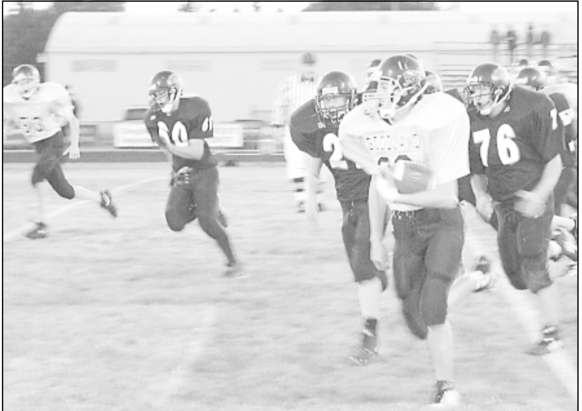
A Cowboy ran with the ball in the "C team" game against Colby on Thursday, Nov. 18. Goodland stayed ahead of the Eagles, winning the game 30-0.