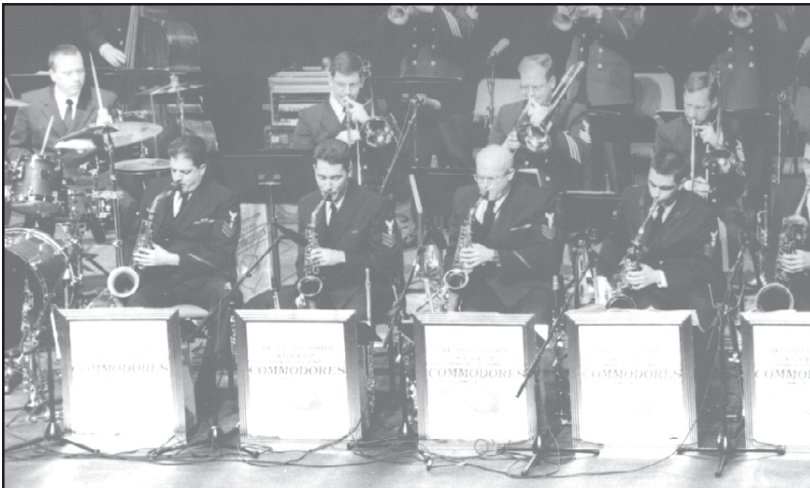
The U.S. Navy Commodores jazz ensemble will present a free concert.