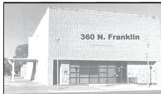
This Building offers lots of square footage, several offices, a reception area, conference room, storage rooms, vault, drive-up window, teller island, parking on the south.

AGENCY AND ESCROW: Farm & Ranch Realty, Inc., and its representatives are the exclusive Seller's Agent. The Gordon Company of Colby, Kansas, will serve as escrow agent and closing agent for this transaction. There will be a closing fee payable to The Gordon Company in the amount of $250.00, with said fee to be paid one-half by the Seller and one-half by the Buyer.