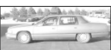
1995 Pontiac Bonneville