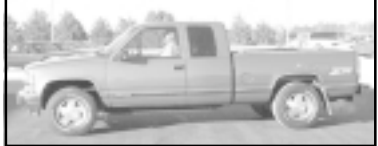
1999 Chevrolet Ext 4x4