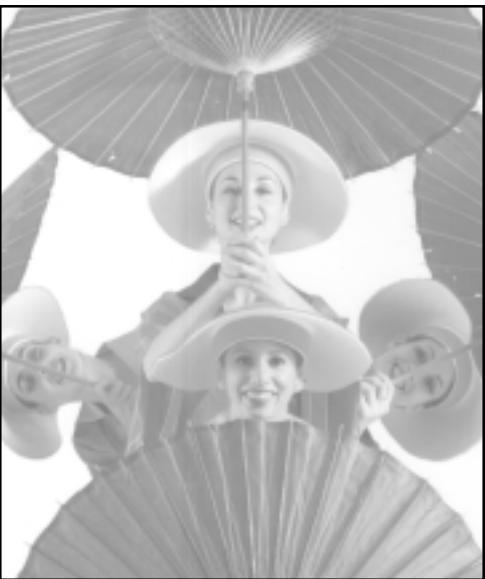
Performers in “Nutcracker”

This untraditional ballet is sponsored by the Western Plains Arts Association, with support from the Kansas Arts Commission and the National