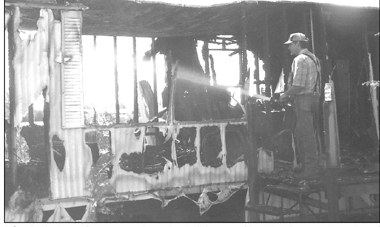
A Goodland volunteer fireman sprayed water into the living room of the trailer where a mother and two of her three children were killed when fire engulfed their home early Memorial Day morning in southwest Goodland.