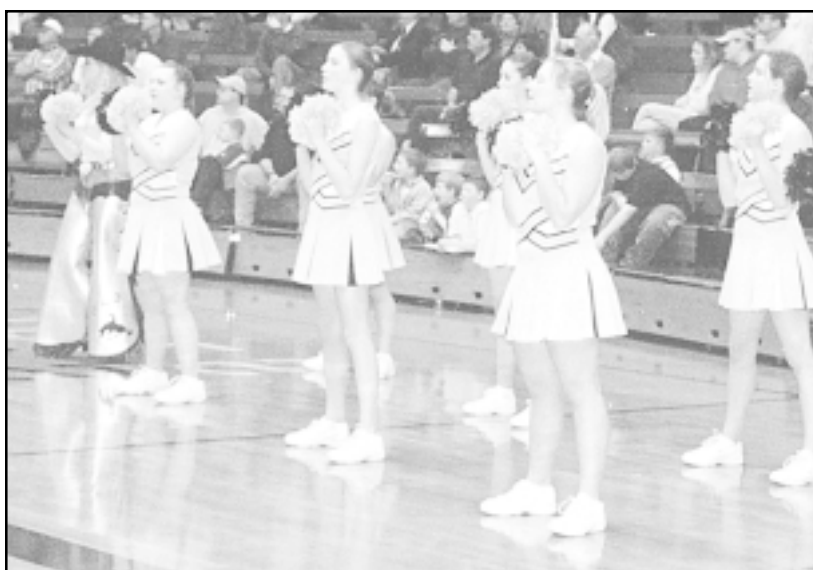
Goodland cheerleaders supported the Cowboy varsity basketball team Tuesday against Lakin at Max Jones Fieldhouse.