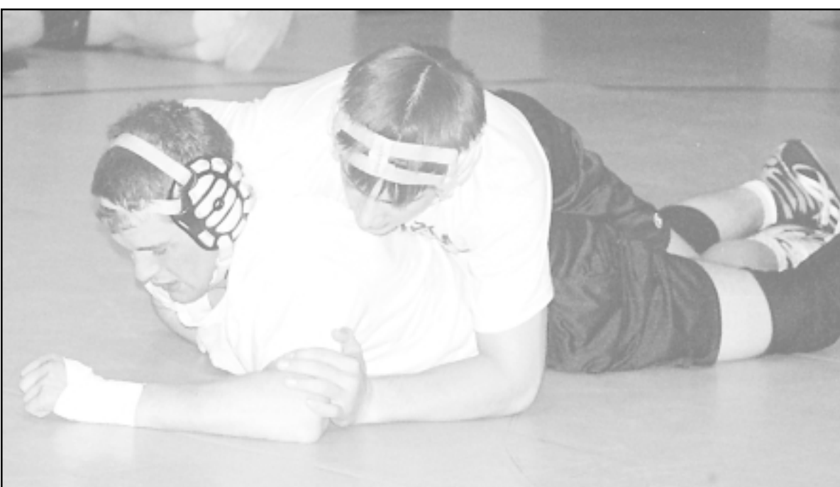
Cowboy wrestlers practiced Tuesday afternoon at Max Jones Fieldhouse.