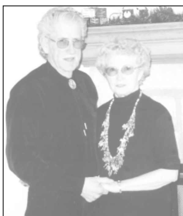
The Zoggs today