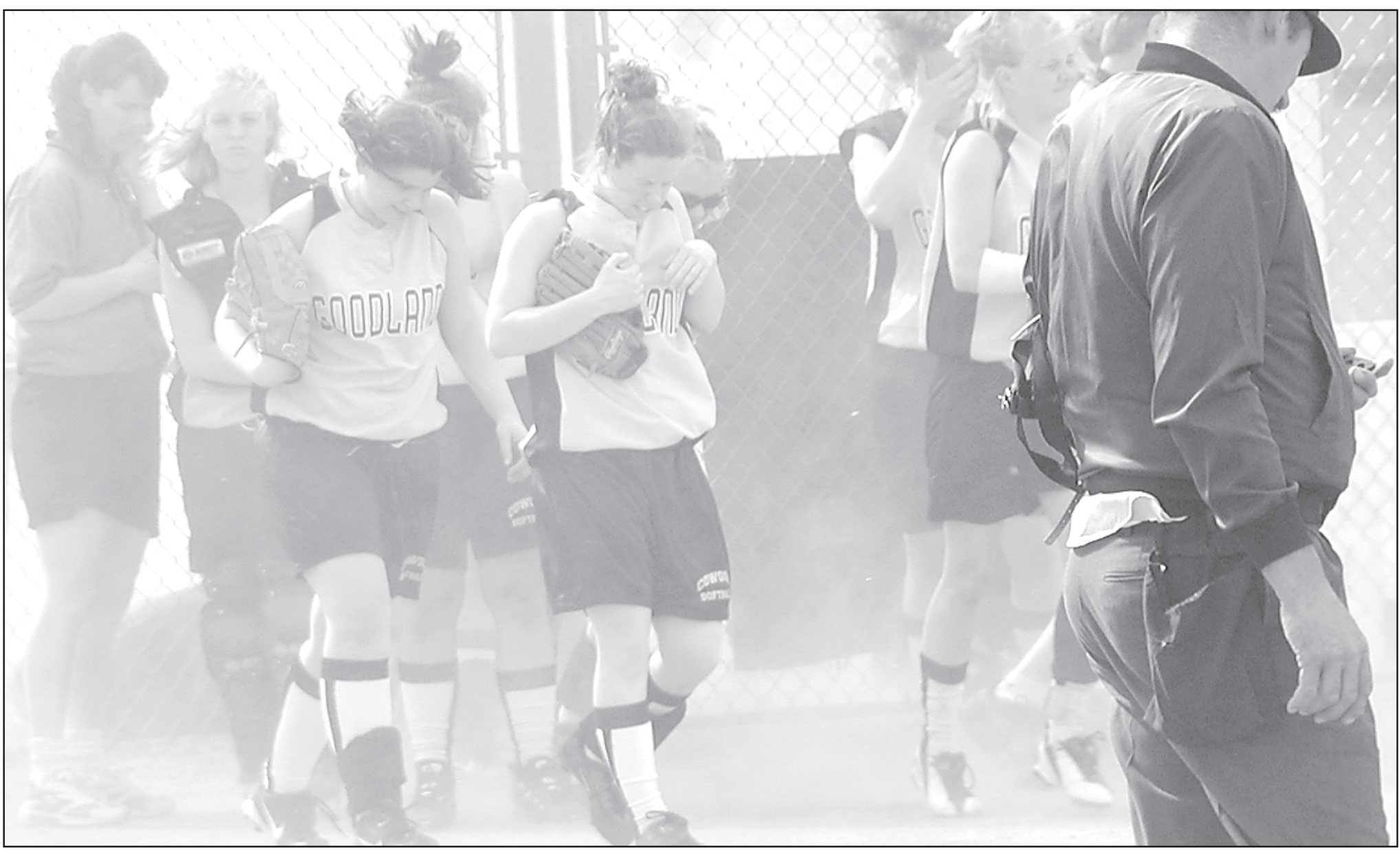
The Goodland Cowgirls tried to take the field Tuesday when high winds (above) sent dirt across the area. The Hays High team hid behind their dugout (bottom left) while the umpires (bottom right) talked about whether to cancel the games.

"We had some opportunities against Reed to do some more damage and we didn't do it," Kansas City's Joe Randa said. "When you're playing here, you need as many runs as you can get."