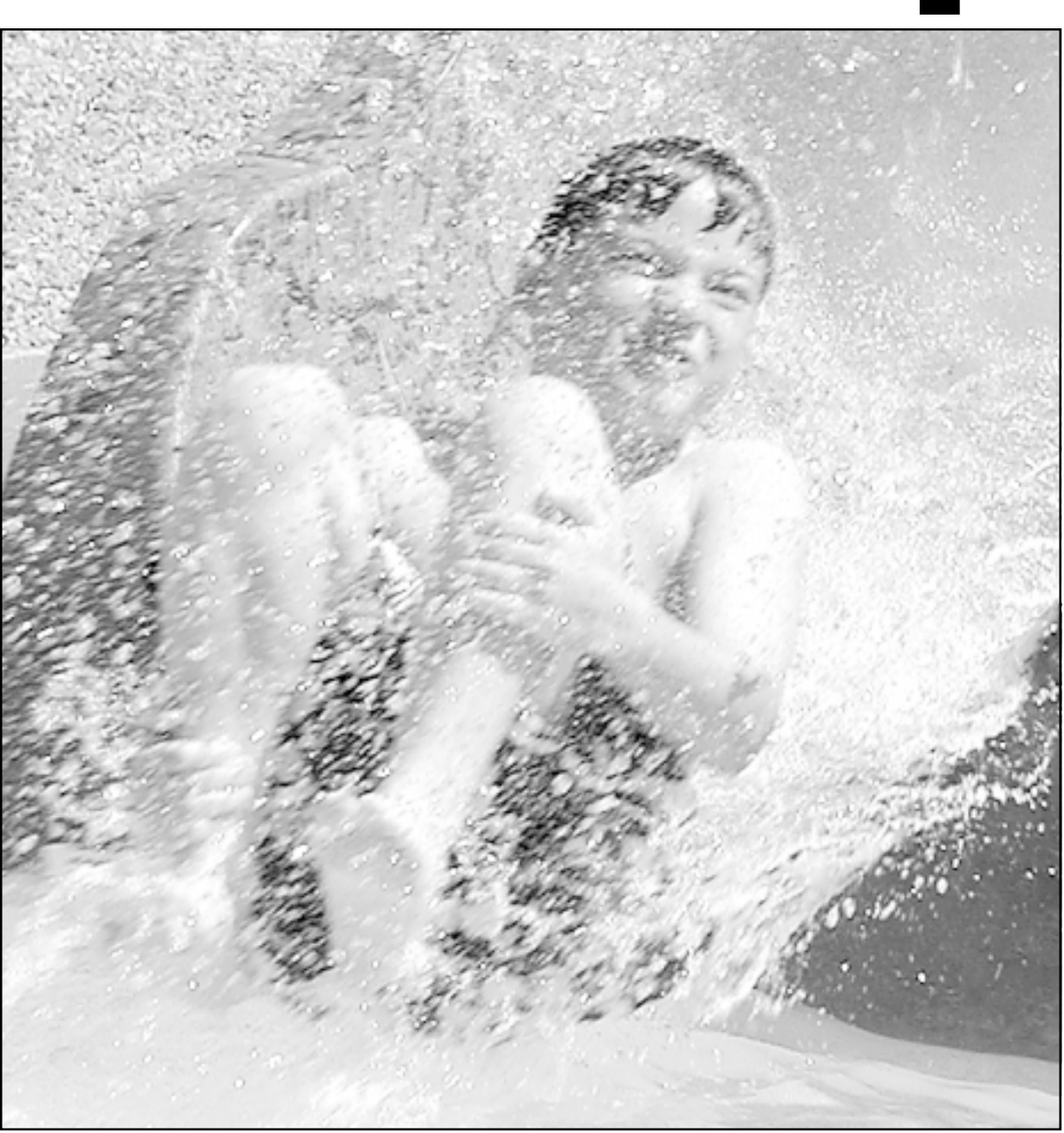
A boy went down a water slide Tuesday at Steever Water Park. Swimming is one of many activities people in Goodland can enjoy in the summer.