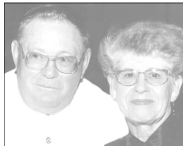
The Hatchers today