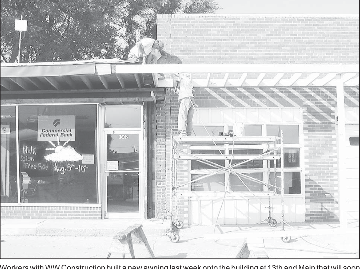
Workers with WW Construction built a new awning last week onto the building at 13th and Main that will soon be a Peoples State Bank.

Commercial Federal, which does certificates of deposit, checking accounts, home mortgages and consumer and car loans, has permanently moved to the Hayden Inc. offices at 1401 Main Ave. and will offer customers the same