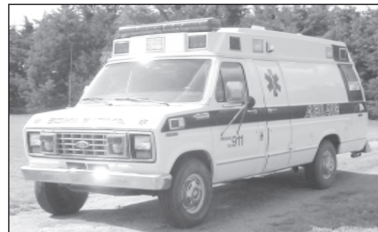
1991 F350 1 Ton Ambulance

180K Miles, very well maintained. (Emergency equipment will be removed.) 6.9 Deisel Engine. Call 899-6010. Asking $1,700 will make a great utility vehicle.