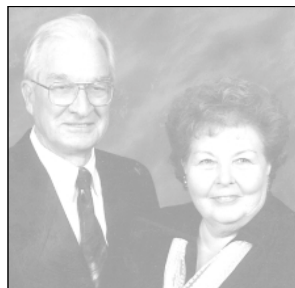
The Barnetts today