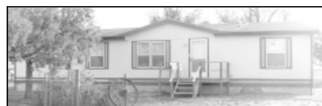
705 Road 67; Kanorado

Affordable country living!!! 3 Bedroom, 2 bath ranch w/detached dbl garage situated on 6 acres 14 miles west of Goodland. Includes redwood deck, machine shed, and numerous other outbuildings. Contact Rose Anderson at 899-3060 or 899-7464.