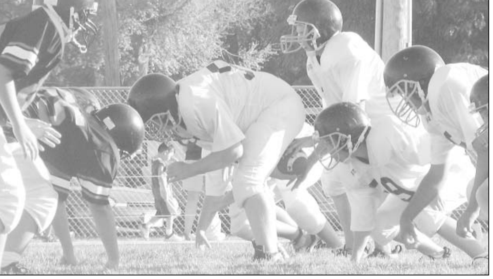
The seventh grade Grant junior high football team tried for one last play half, but lost 24-10. The eighth grade Mustangs won 8-0. before half time Thursday at Cowboy Stadium. The Mustangs led at the