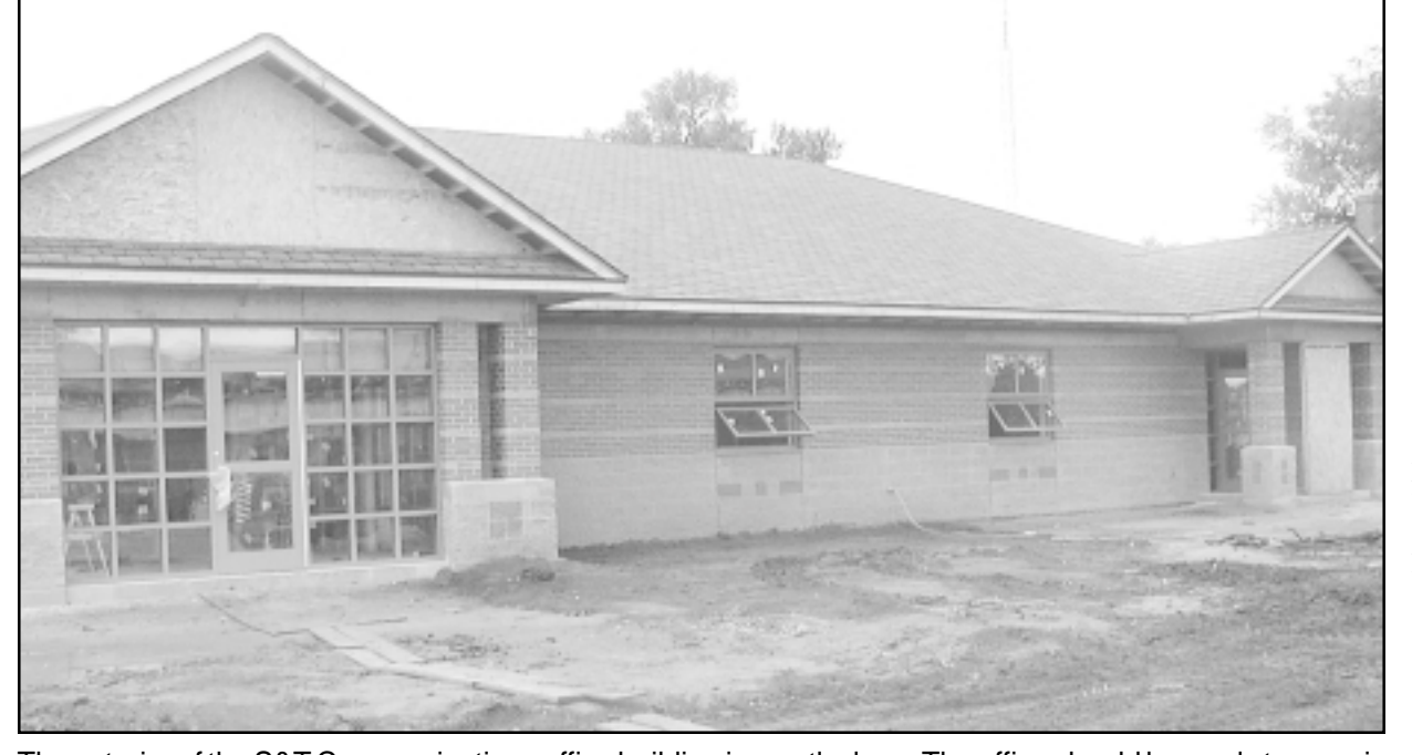
The exterior of the S&T Communications office building is mostly done. The office should be ready to open is less than two months.