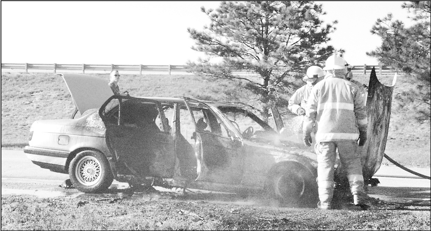
The Sherman County Rural Fire Department hosed down a car fire about 5 p.m. Wednesday on the eastbound off ramp at Caruso, exit 12 west of Goodland on I-70. The fire destroyed the 1991